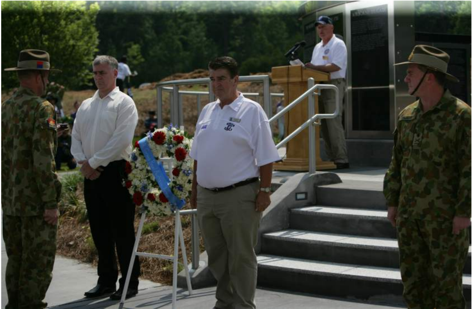
An Australian Veteran, Gold Star Family Member, and Serving Warriors