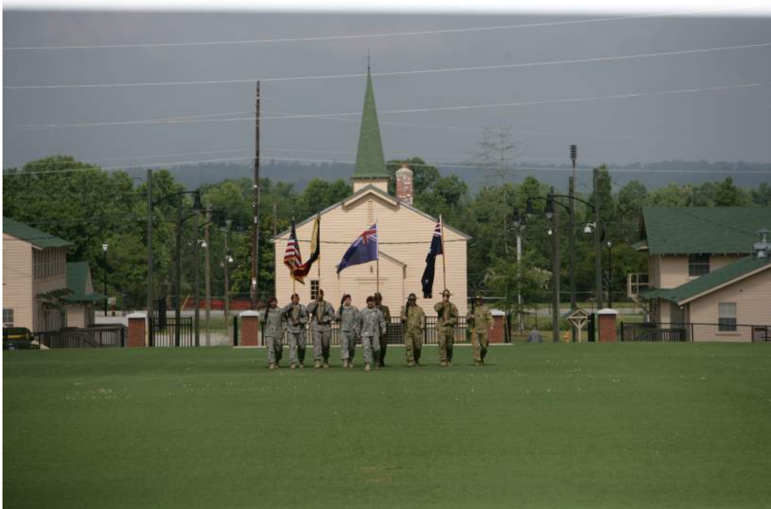
A Multinational Color Guard....