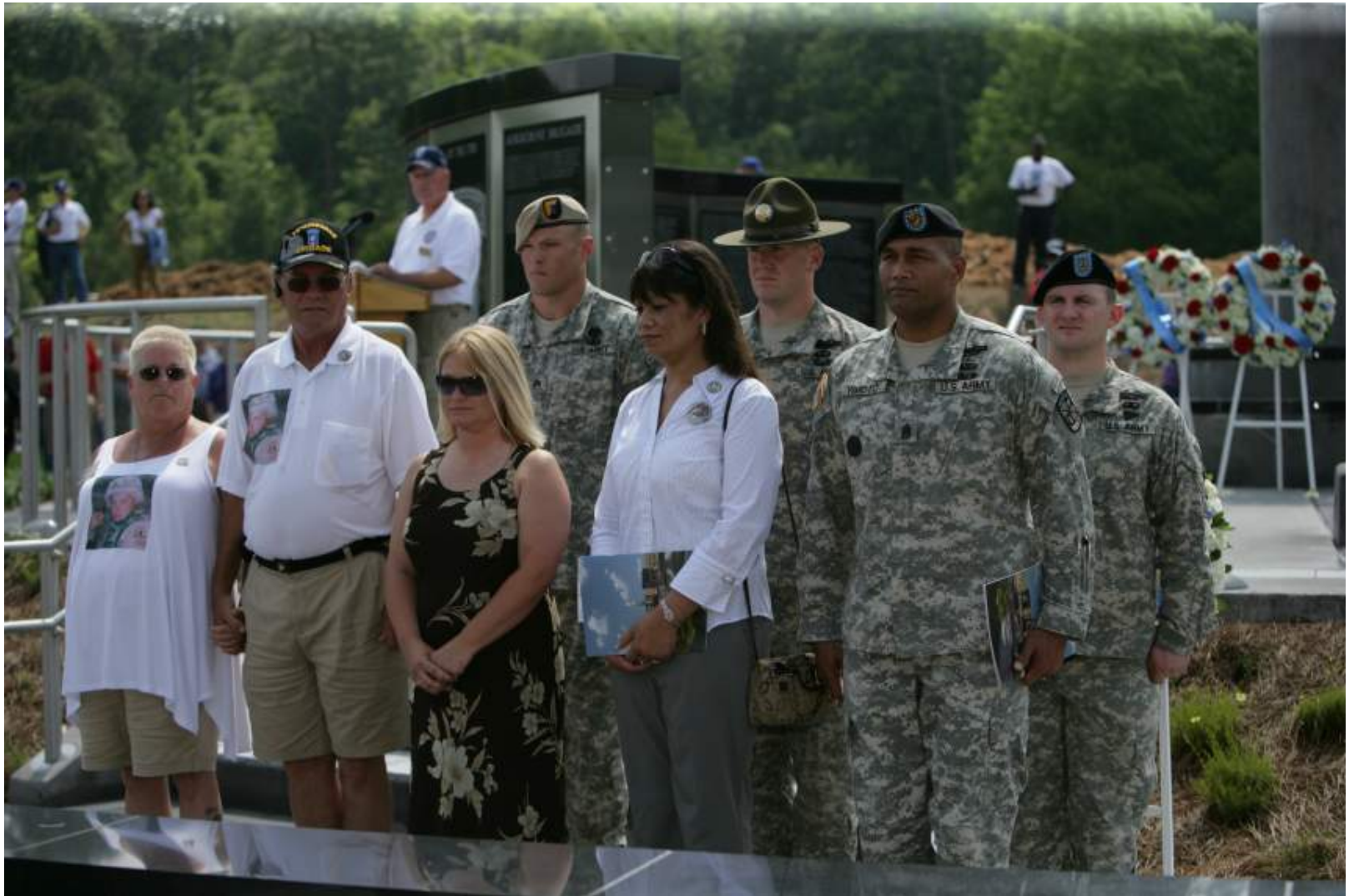
Accompanied by Gold Star Family Members