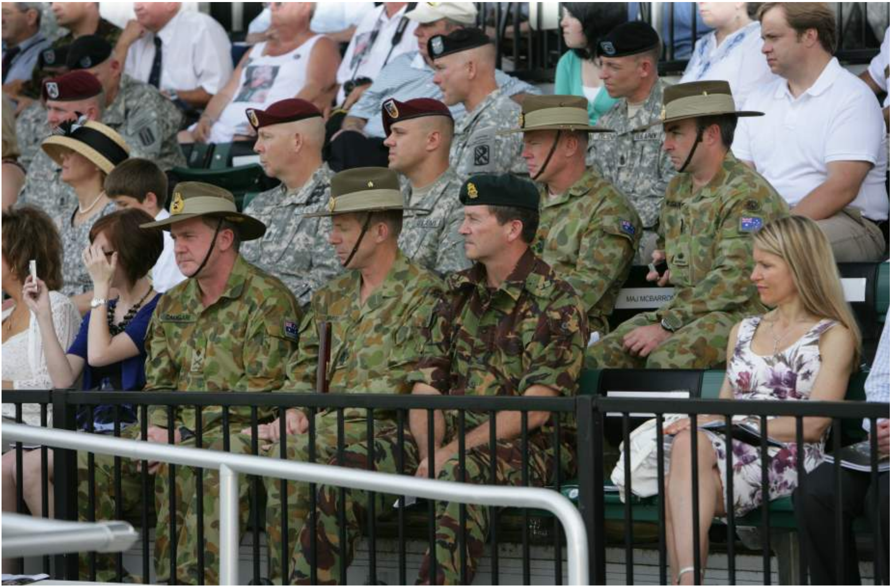
Our Allies came from afar.