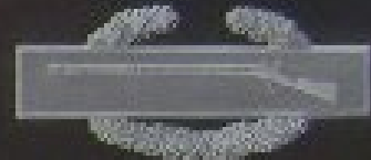
COMBAT INFANTRYMAN BADGE