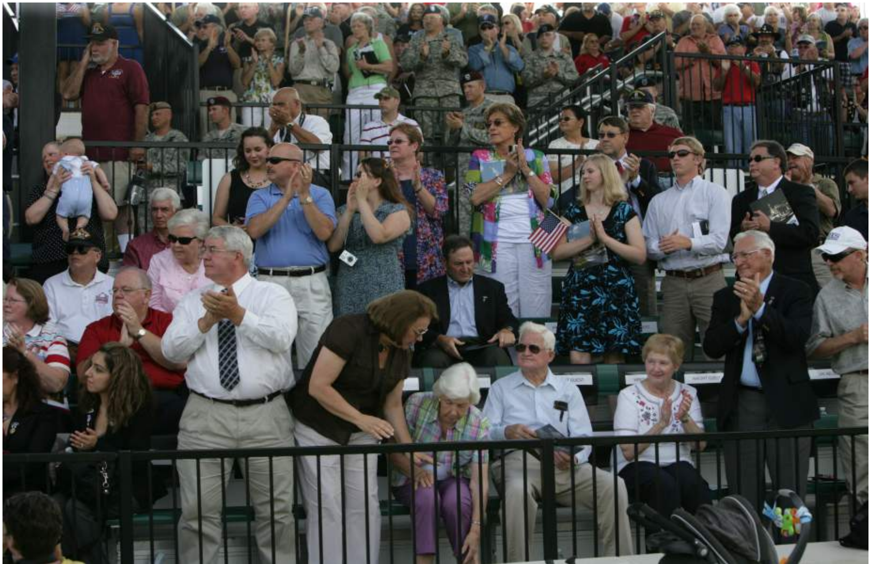
Friends of Sky Soldiers.