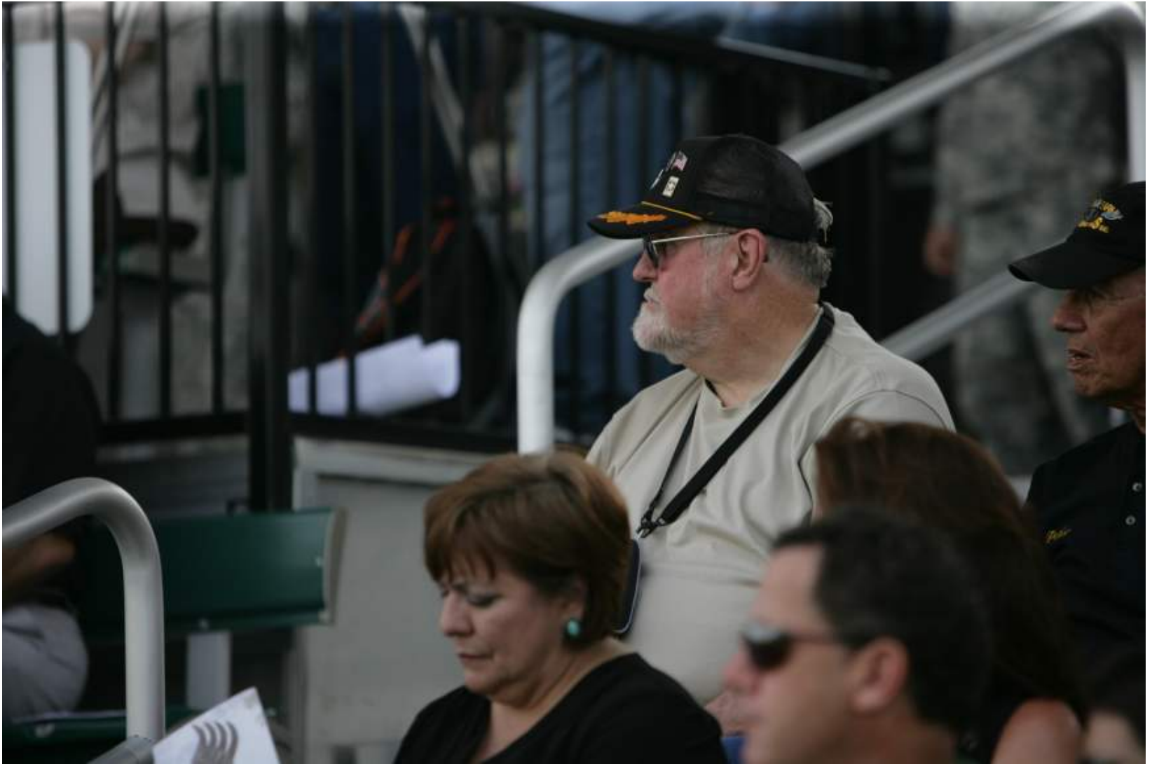
Proud Veterans remembering.