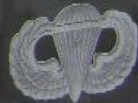
COMBAT PARACHUTIST BADGE