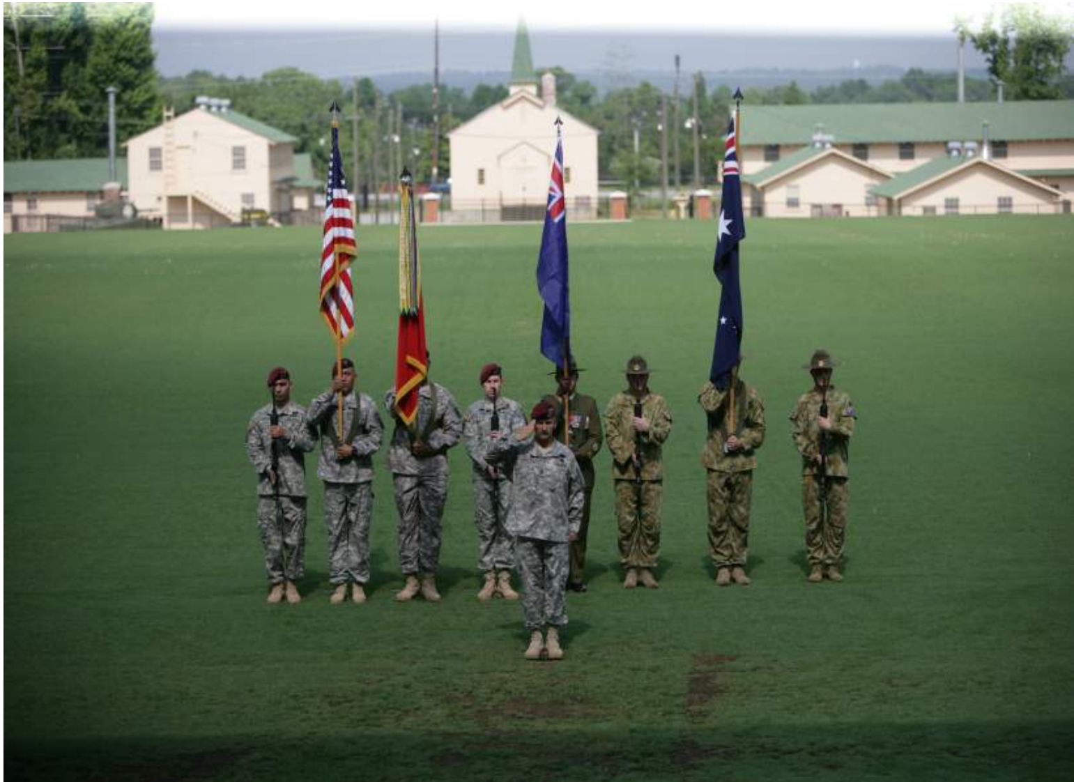
CSM Rolling Presented the Colors