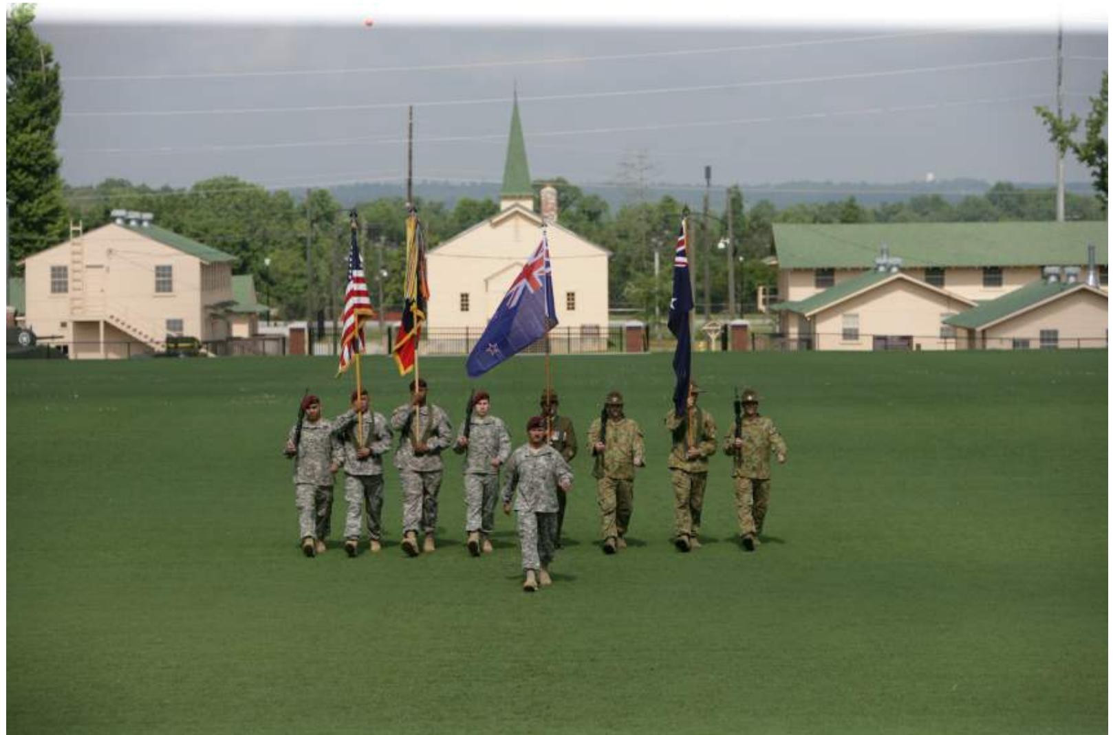
Bearing the US, Australian and New Zealand Flags