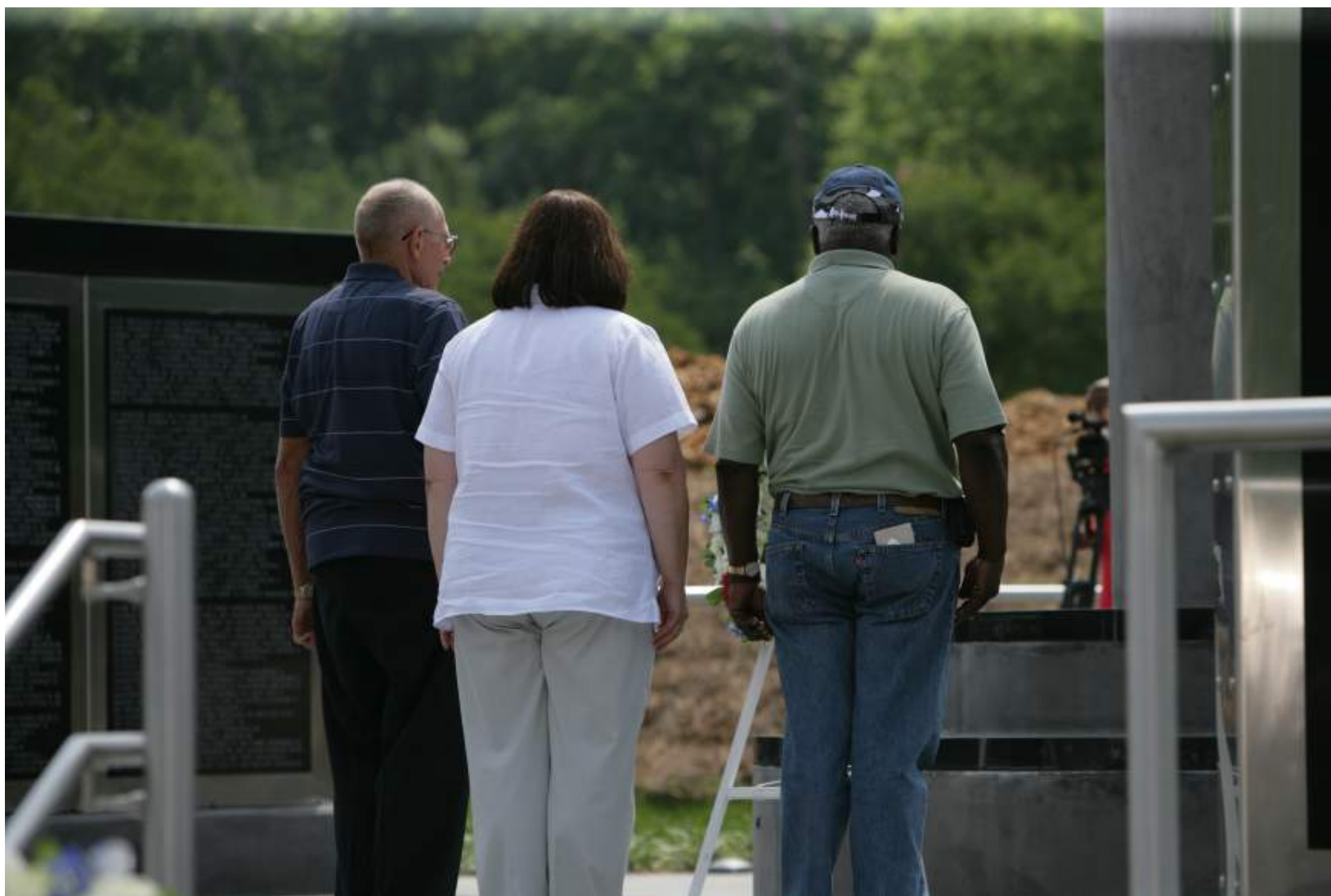
Presented a Wreath