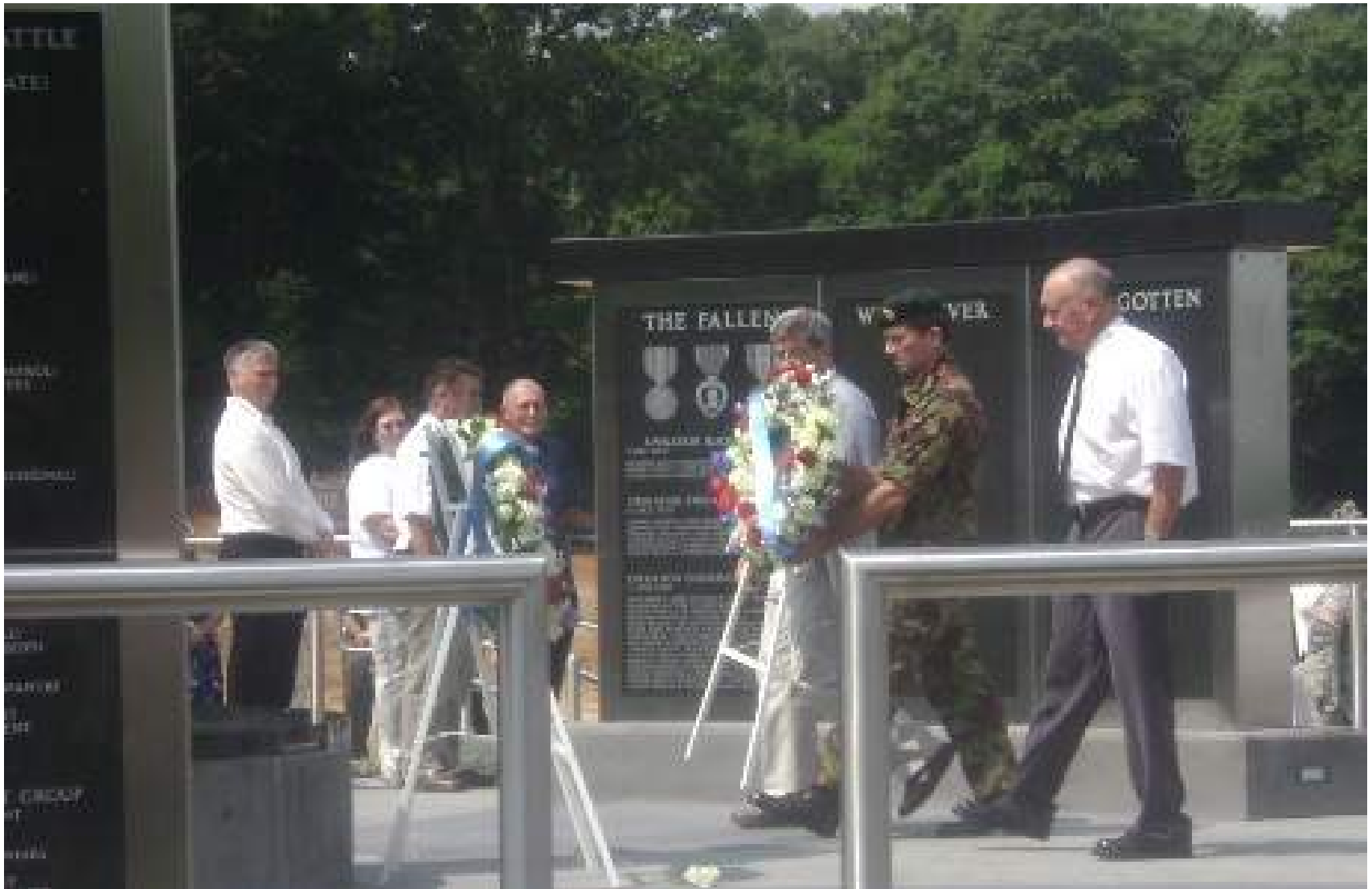
Presented their wreath