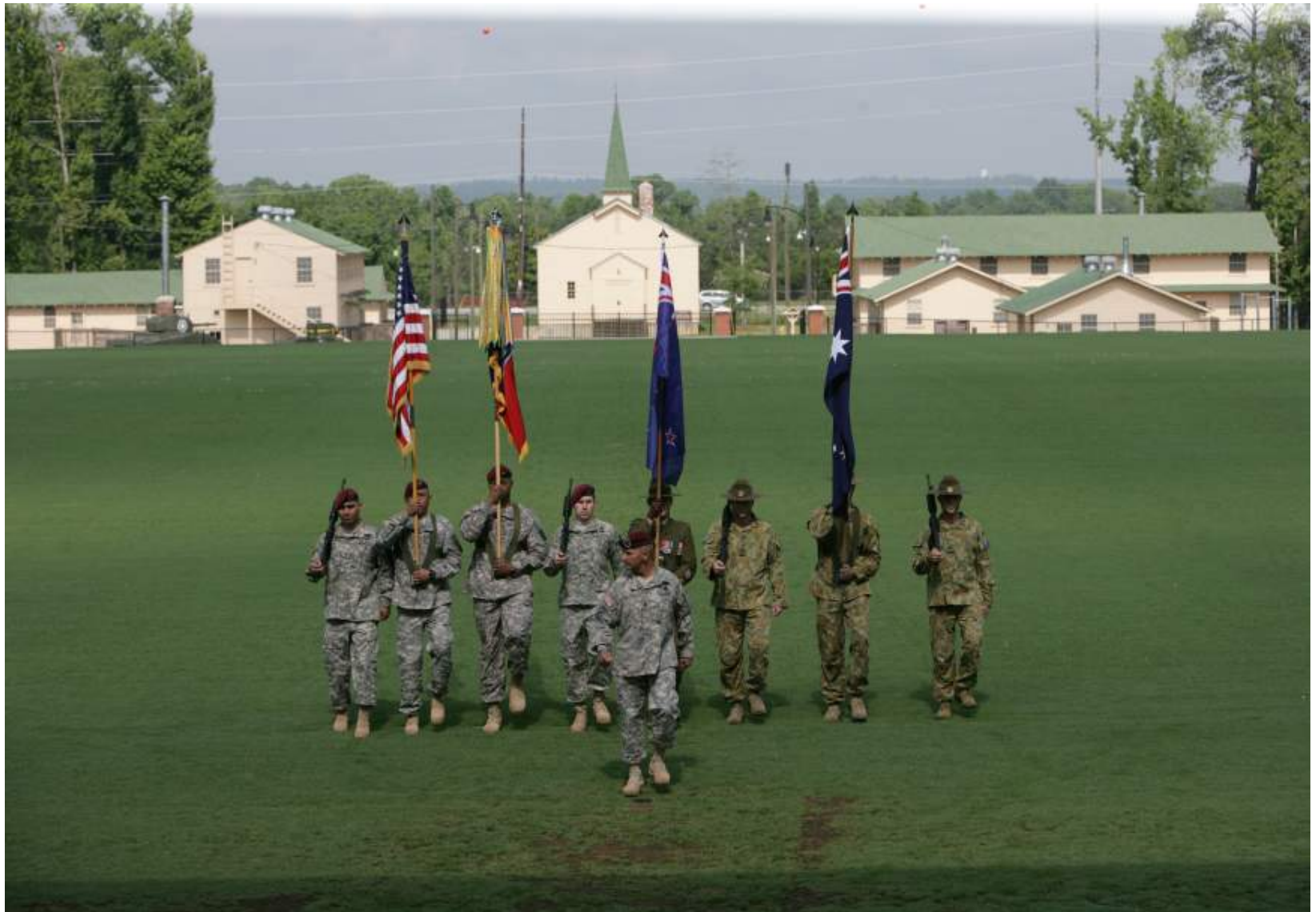
Positioned themselves in front of the bleachers.