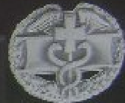
COMBAT MEDICAL BADGE