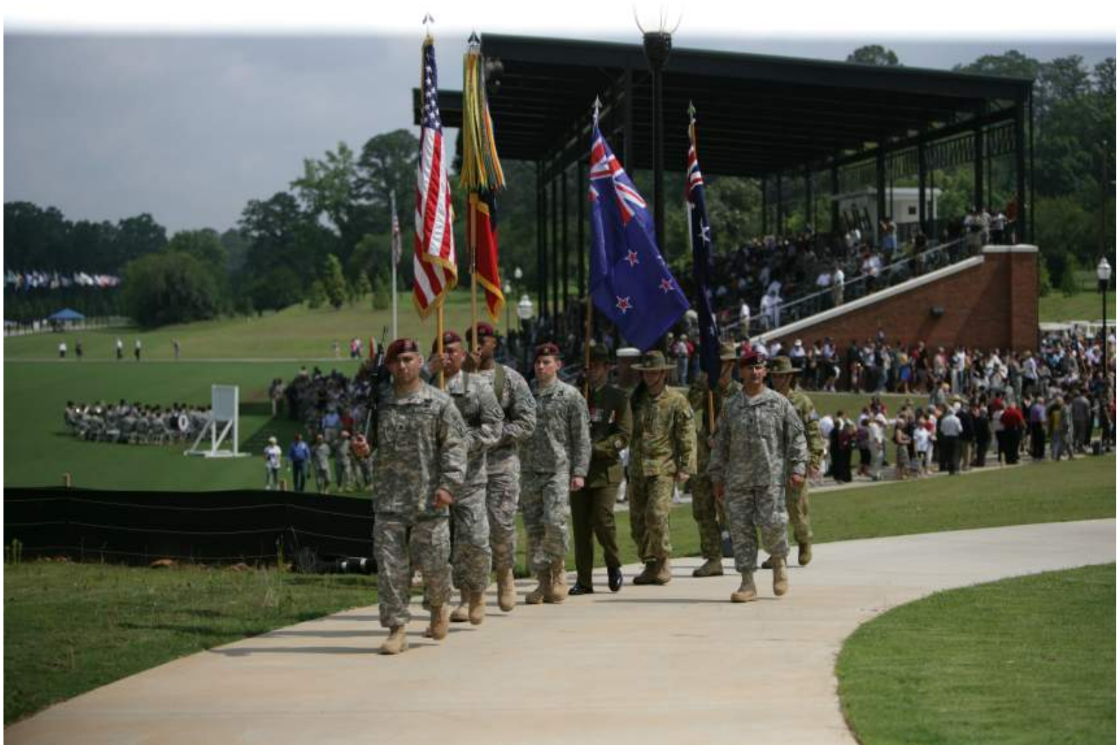
Preceded by the Colors