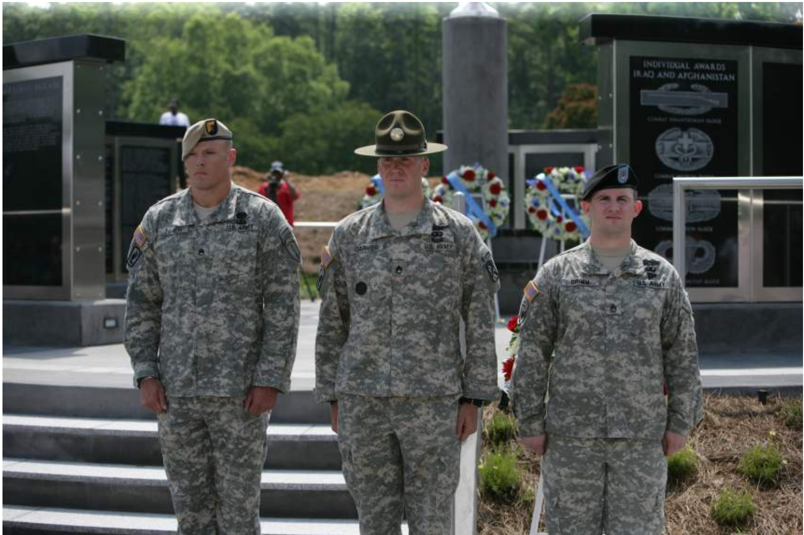
OIF and OEF Veterans