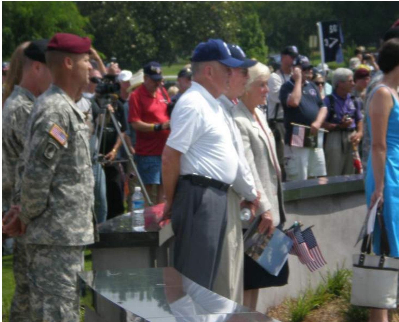
Active Duty Warriors and Veterans