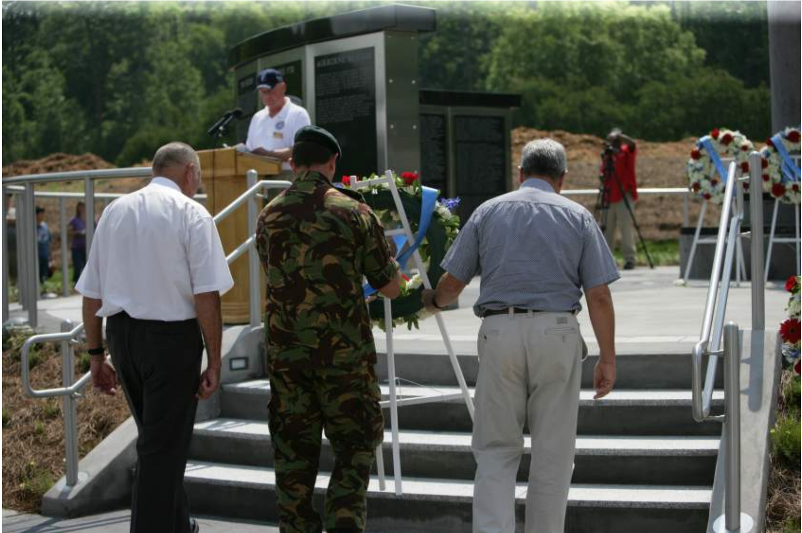
New Zealand Veterans and Serving Warrior