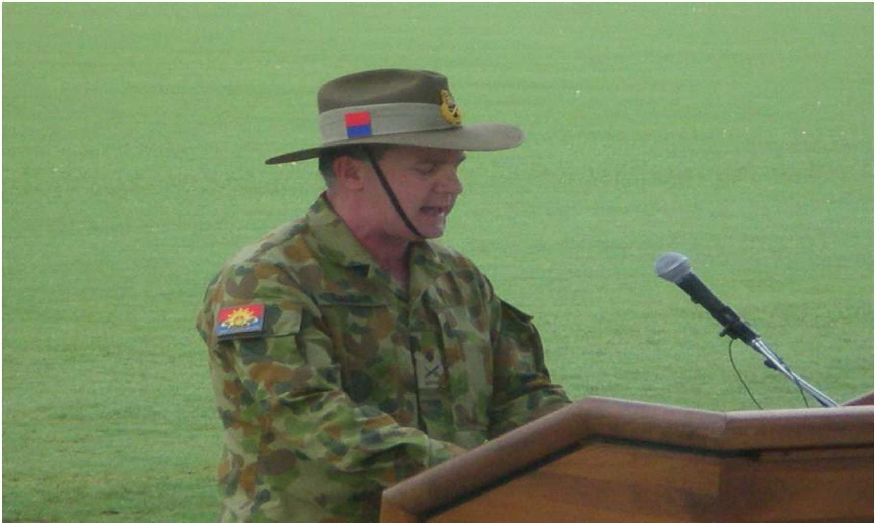
Australian MG Caligari spoke of brotherhood and service