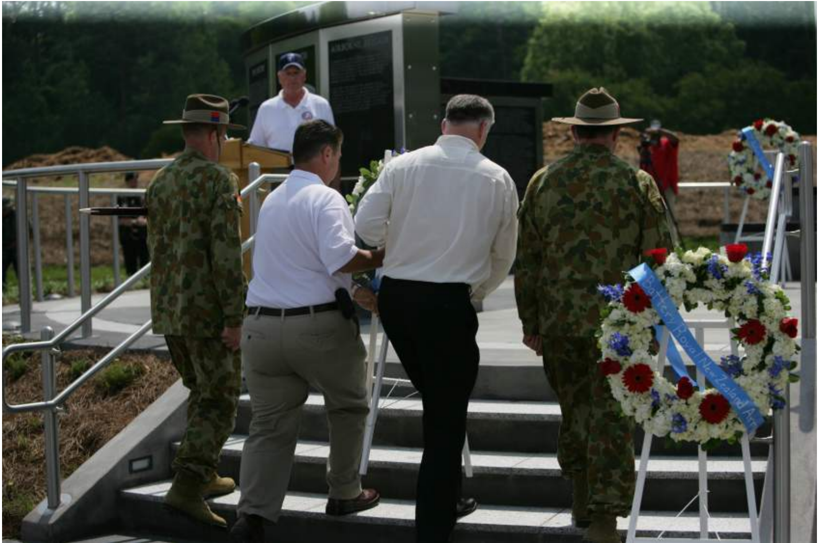
Presented their wreath