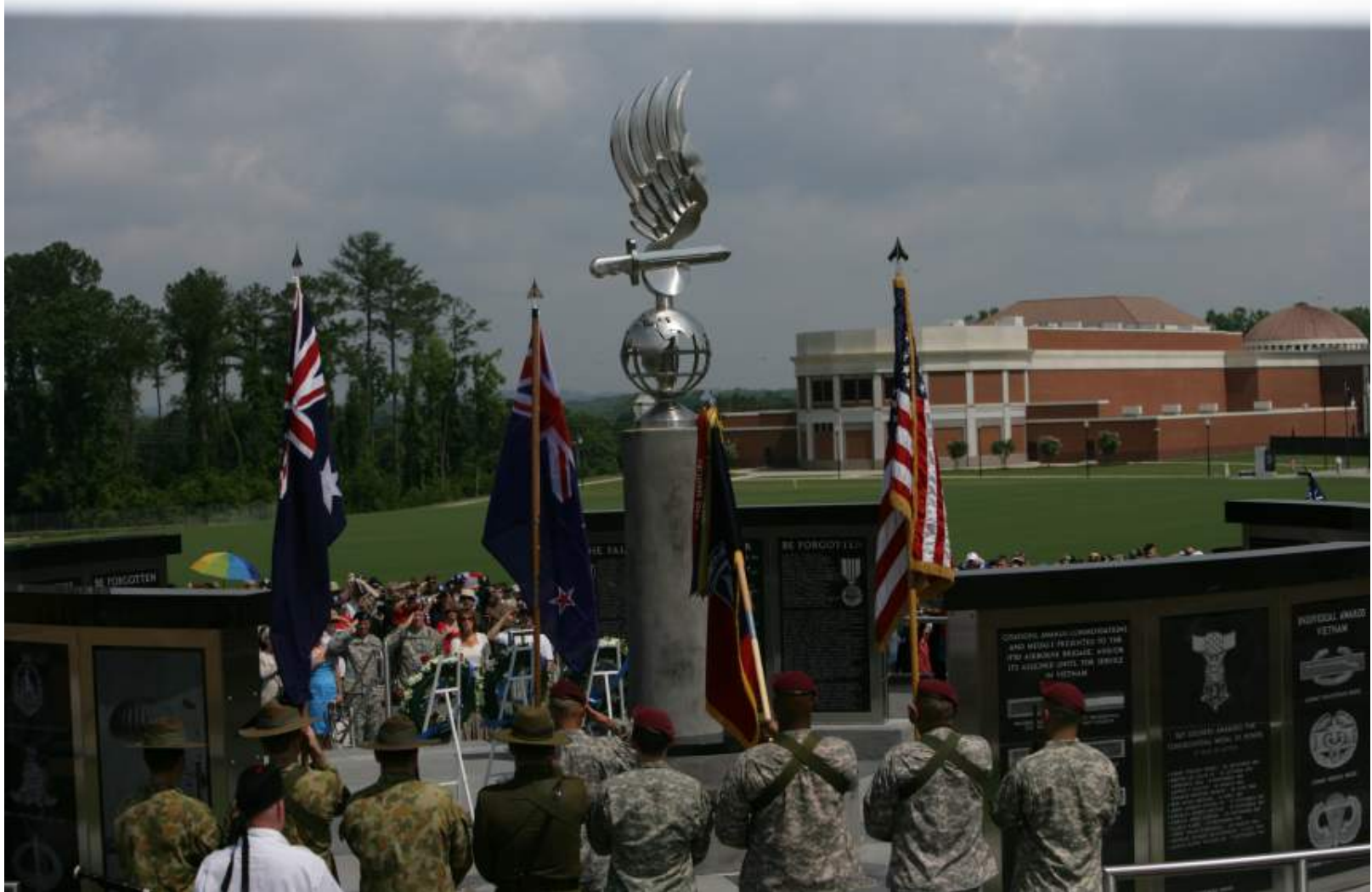
The Color Guard rendered final honors.