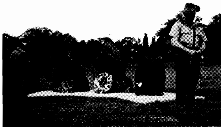
THE MEMORIAL DEDICATION 5/7 RAR LINES

Rest ye O' Warriors You'll battle no more No longer to live the horrors of war Your duty was done with honour and pride Farewell O brother Until we march by your side.