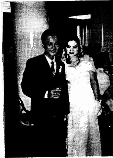
The Happy Couple

and my background. I have learnt to treat every male of this age as a veteran. He hugged and kissed me like a long lost brother. This spirit was continued by everyone at the wedding.