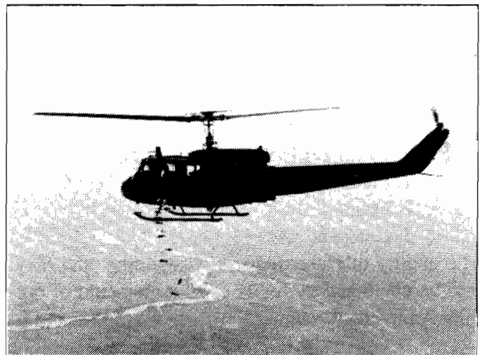
Say "hello" to an old friend - Huey Helicopter (MAD) Mortar Air Delivery