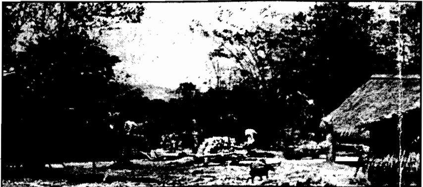
The Vietnamese children and their villages ... "The people had nothing. All around there was severe malnutrition, and the housing was poor even for a subsistence peasant lifestyle. They were literally in rags."