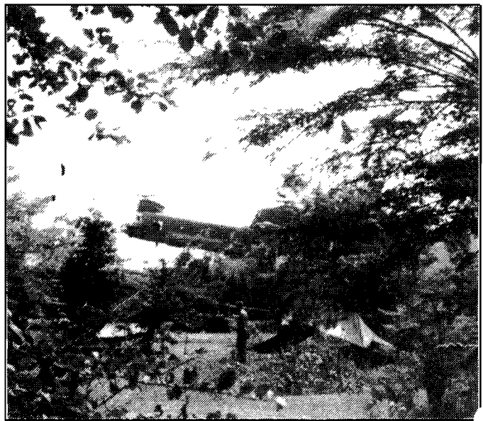
Long Son Island Resupply

. Manly Beach Resort Hotel. 6 Carlton Street Manly. Telephone (02) 977 4188. 2 stories. 39 units all with shower and toilet. Restaurant. Heated pool and spa. 3 stars. Opposite the beach. Bed and light breakfast - 2 people $75.