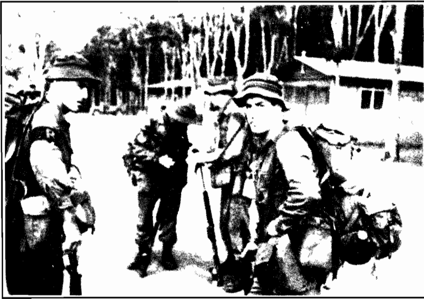
Preparations Prior to Ops