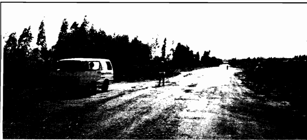
LUSCOMBE AIRFIELD looking west '94

We also took day trips to MYTHO in the MEKONG DELTA and to the CU CHI Tunnels. The Delta is a contrast after the type of country that we operated in and is an enjoyable day visiting homes and villages on small islands in the river. During our visit to the CU CHI Tunnels, whilst being shown a map used to plan the '68 TET OFFENSIVE on Saigon, I pointed out PHOC TUY to the guide and asked about