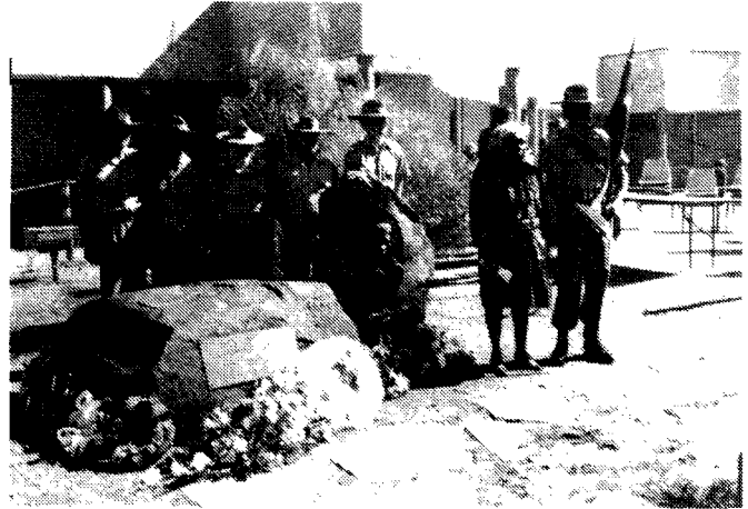
Pte. Drummond's mother attending ceremony held at Civic Centre Gardens Western Australia