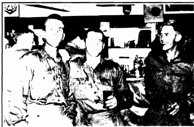
Three Sergeants 5 RAR 1969'70

TIGER TALES , 5 RAR Association newsletter, will be published three times a year in February, June/July and November. Contributions welcome.