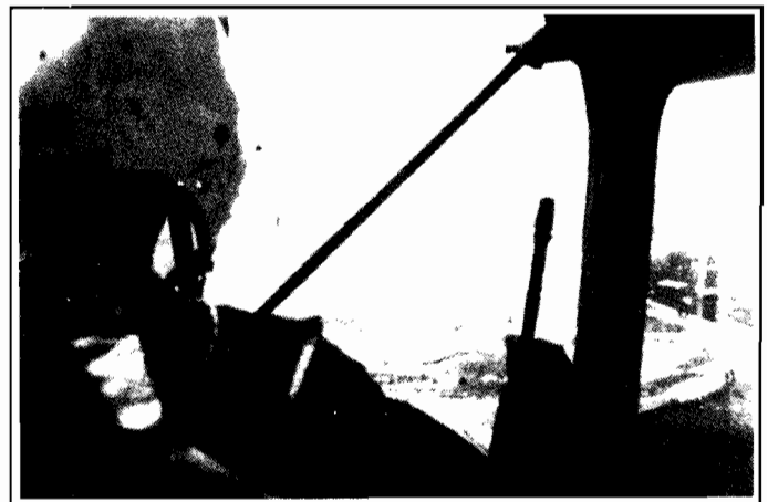
Luxembourg Field "Coming Home"