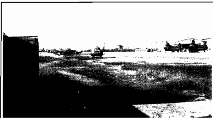
Vietnam Air Force Base