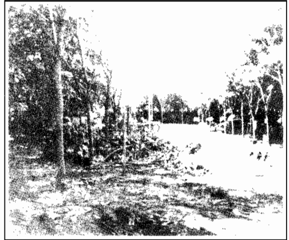
Early Stages of Construction Nui Dat 1966